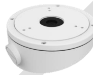
DS-1281ZJ-S Inclined Base Mount