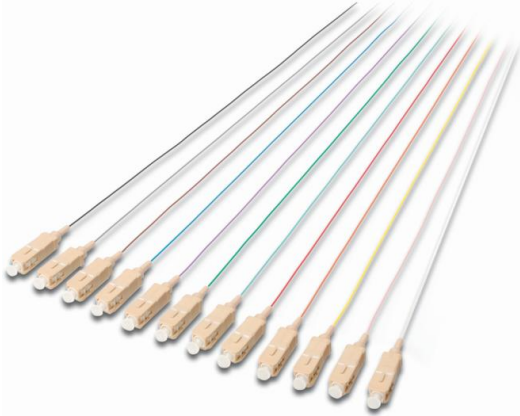
DK-25221-02 (SC Simplex, OM2)